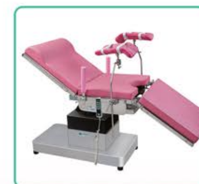
Back section adjustment